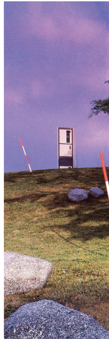
Cover photo: The crisp, clear displays of the Sun-4/200 Series put ECAD and other applications into sharp perspective.

Using a parallel addressing path, the CPU accesses the cache, main memory, and Memory Management Unit (MMU) simultaneously. If the data is not resident in the cache, the MMU automatically translates the address to main memory. Sun's sophisticated MMU facilitates rapid switching between multiple processes and assures fast main memory cycle time whenever data moves in or out of the cache.